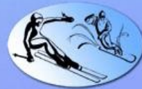
Table of Contents March 2024

The Newsletter of the Wilmington Ski Club