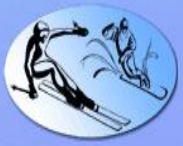
Table of Contents February 2024

The Newsletter of the Wilmington Ski Club