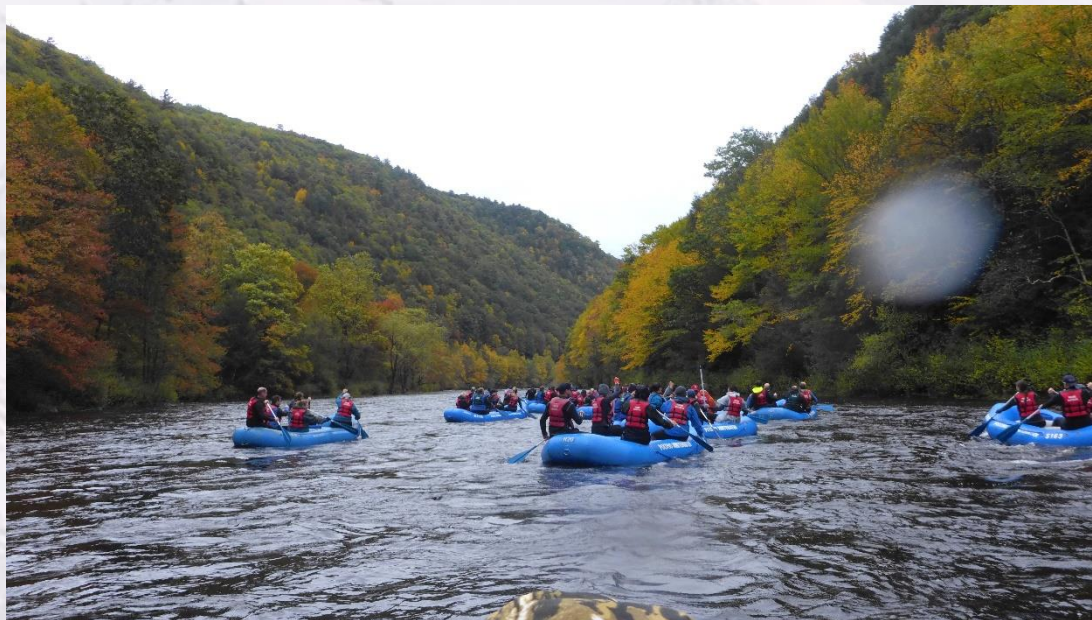
A gentle wave train with a view of fall foliage in the Lehigh Gorge.