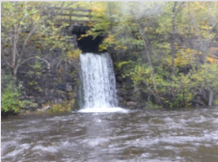
We by-passed some of the rapids.