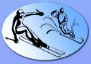
Table of Contents November 2023

The Newsletter of the Wilmington Ski Club