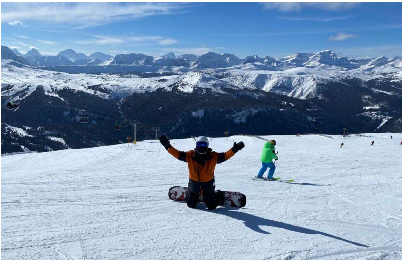
Be One with the Mountain