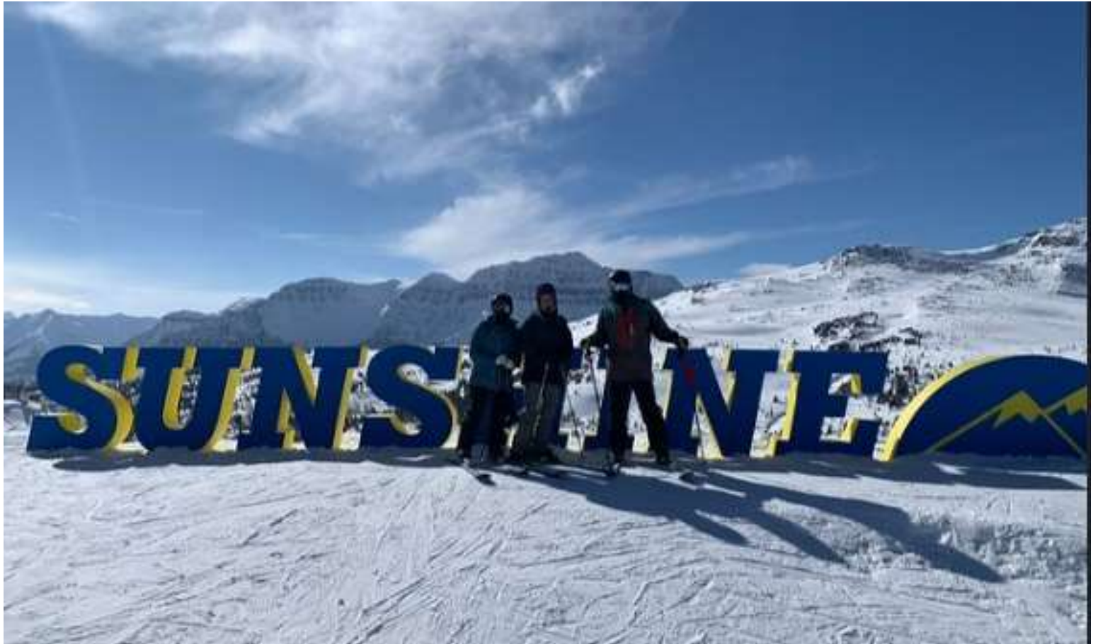
Skiing in Sunshine at Sunshine