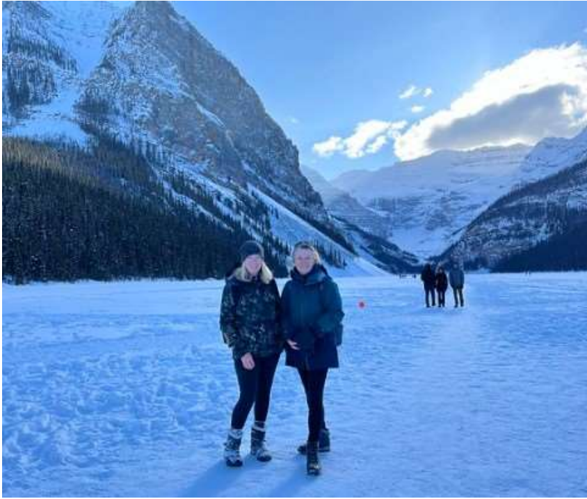
Walking on the Ice at Lake Louise