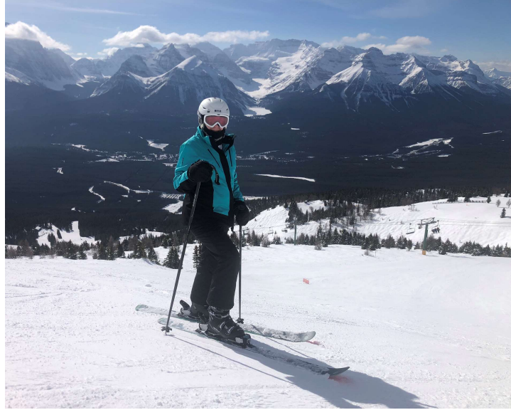
Skiing the Canadian Rockies