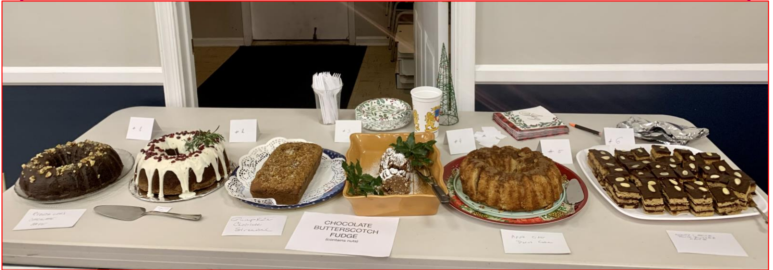
Cake Division Entries