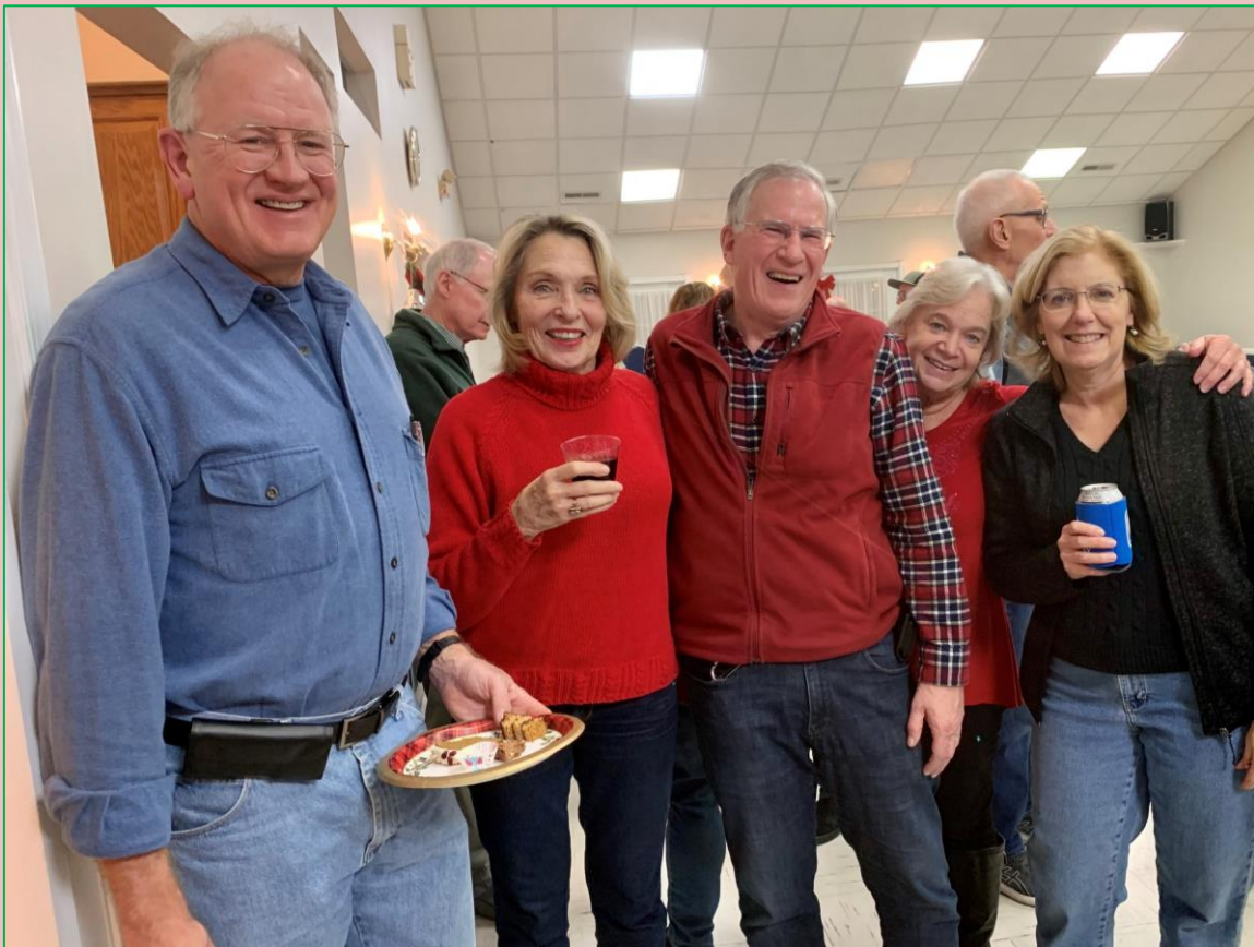
Some of the Judges