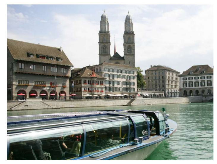
New signups, payment in full required.

4* Glockenhof Zurich (with breakfast) Restaurants and Spa; located in heart of Zurich very near to the banks of Lake Zurich and Zurcher Bahnhofstrasse; visit Grossmunster Church, Swiss Financial Museum and FIFA Museum, take a boat trip on River Limmat or meander thru the Old Town https://www.glockenhof.ch/en/