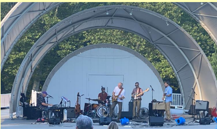
“The Core” performing ...