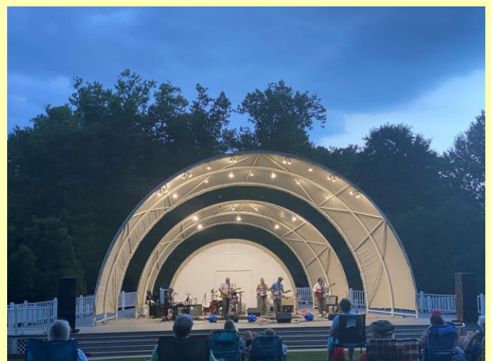
... and then the storm came.