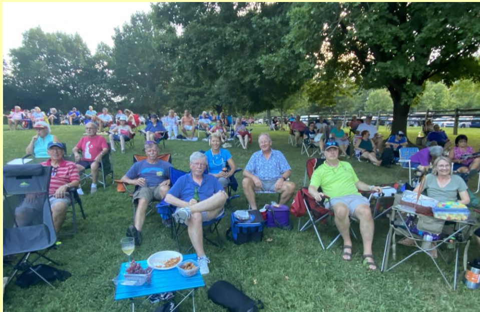
Nice warm summer evening, enjoying the music.