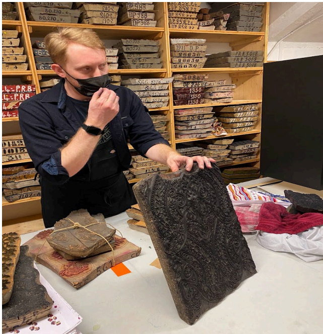
Silk Demonstration Screening in Lyon