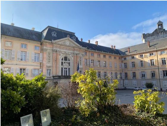
Prefecture de La Savoie