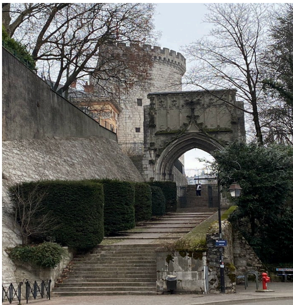
Medieval Castle of the Dukes of Savoy