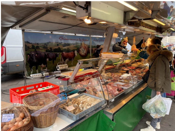
Market Day along the Soane River