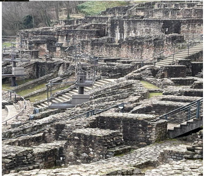
Ancient Fourvière Theatre in Lyon