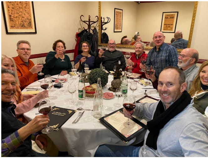
Dinner in Lyon (best picture, sorry for partial)