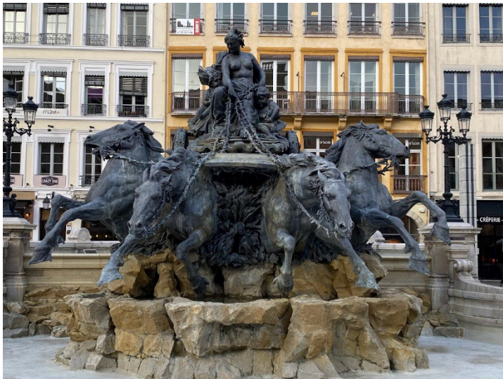
Fontaine Bartholdi is a fountain sculpted by Frédéric Auguste Bartholdi