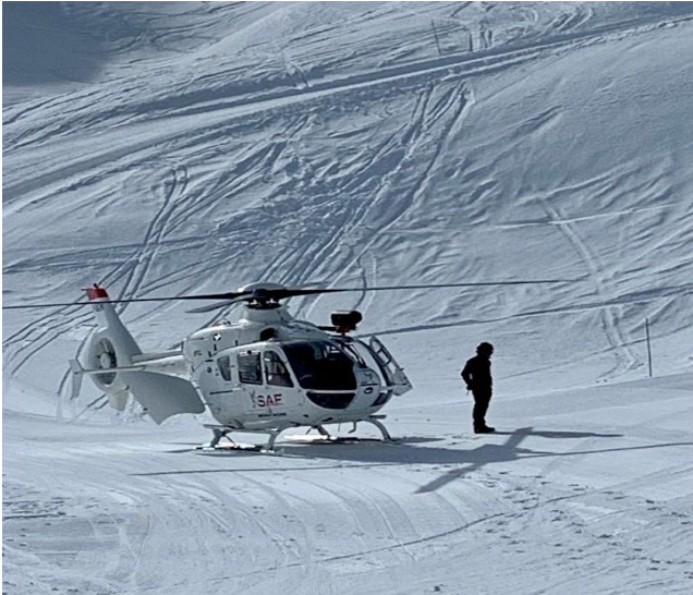
Before the Storm