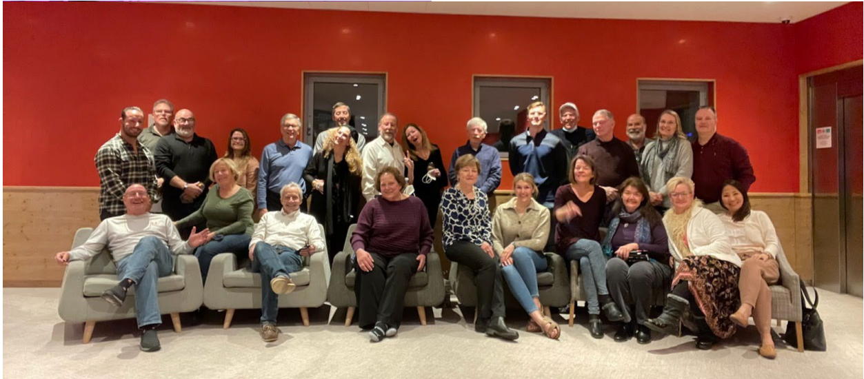
View from Club Med Rooms