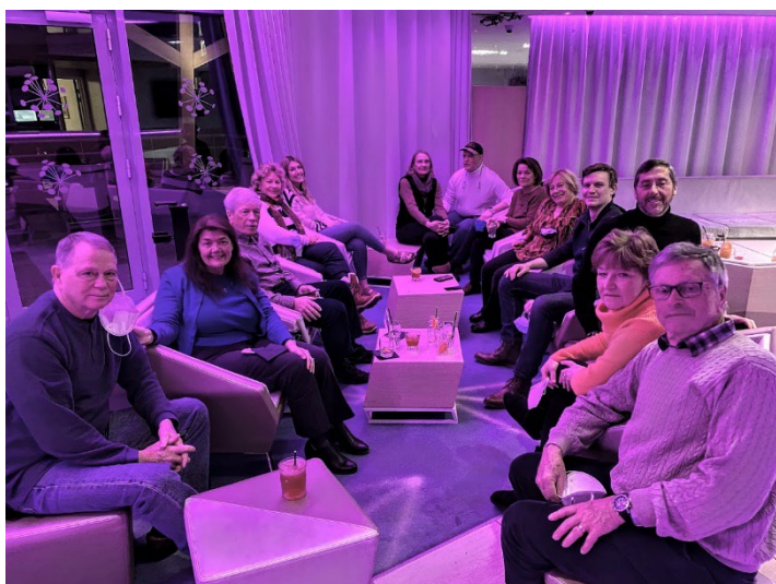
Hanging out at the Bar!